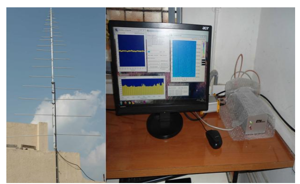
Fig. 1. LPDA installed on terrace of the building.

Now a day, a worldwide network extended-Compound Astronomical Low-cost Low-frequency Instrument for Spectroscopy and Transportable Observatory (e-CALLISTO) is keeping watch on different solar activities. CALLISTO network collects data located in many countries and data is made available worldwide. For full coverage of the solar radio emission, the number of stations is being connected to Callisto network using a public web interface [12]. The CALLISTO is a programmable heterodyne receiver built at ETH Zurich, Switzerland. Mainly used in applications such as observation of solar radio bursts and monitoring of RFI for astronomical science and education [13]. e-CALLISTO was installed at KTHM college, Nashik, Maharashtra (India). The locations details are as follows: Latitude 20.00, Longitude 73.78 and Altitude 576 meter. The photograph of the working system is shown in Figure 1. It includes the PC, controller circuit and CALLISTO. PC monitor screen shows the real time data acquisition of solar radiations using CALLISTO [14].